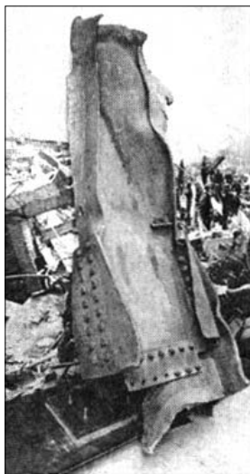
Sad sculpture: A twisted piece of steel from the World Trade Center demonstrates the destruction.

A dirt- and rust-encrusted airplane window appears antique, not 5 years old. Like the twisted steel girder propped up nearby, the museum doesn’t specify which plane, or tower,