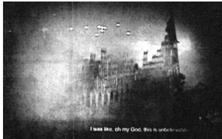
Historic event: One display has a looping video of the cleanup and rescue operations after the attacks in New York.

Thirteen floor-to-ceiling panels present a timeline, including quotes from that day.